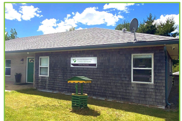
Porters Lake Office