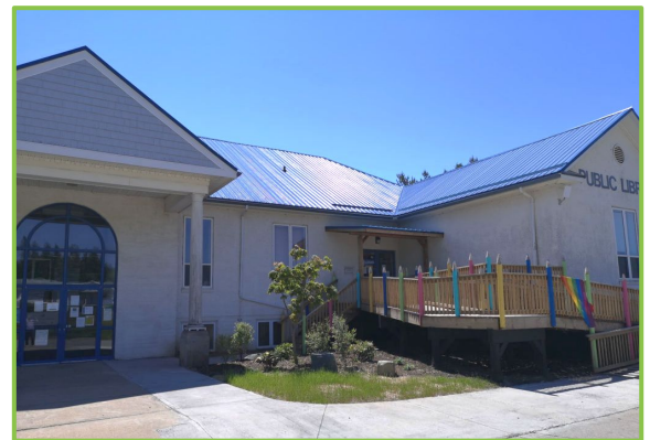
Sheet Harbour Office