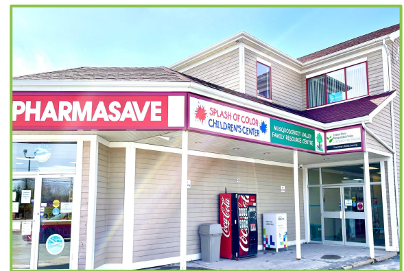
Middle Musquodoboit Office